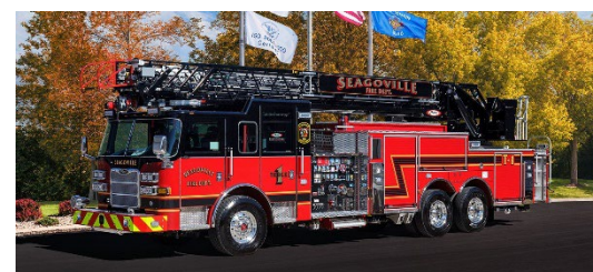
New delivery of a 100' Aerial from Pierce, example photo only.

The committee spent a couple hours reviewing various types of ladder trucks, pros and cons and the needs of our district. There are several contacts and nearby agencies that can also provide valuable insight to our committee. The committee continues to work towards providing this piece of equipment that will meet our needs for years, decades.