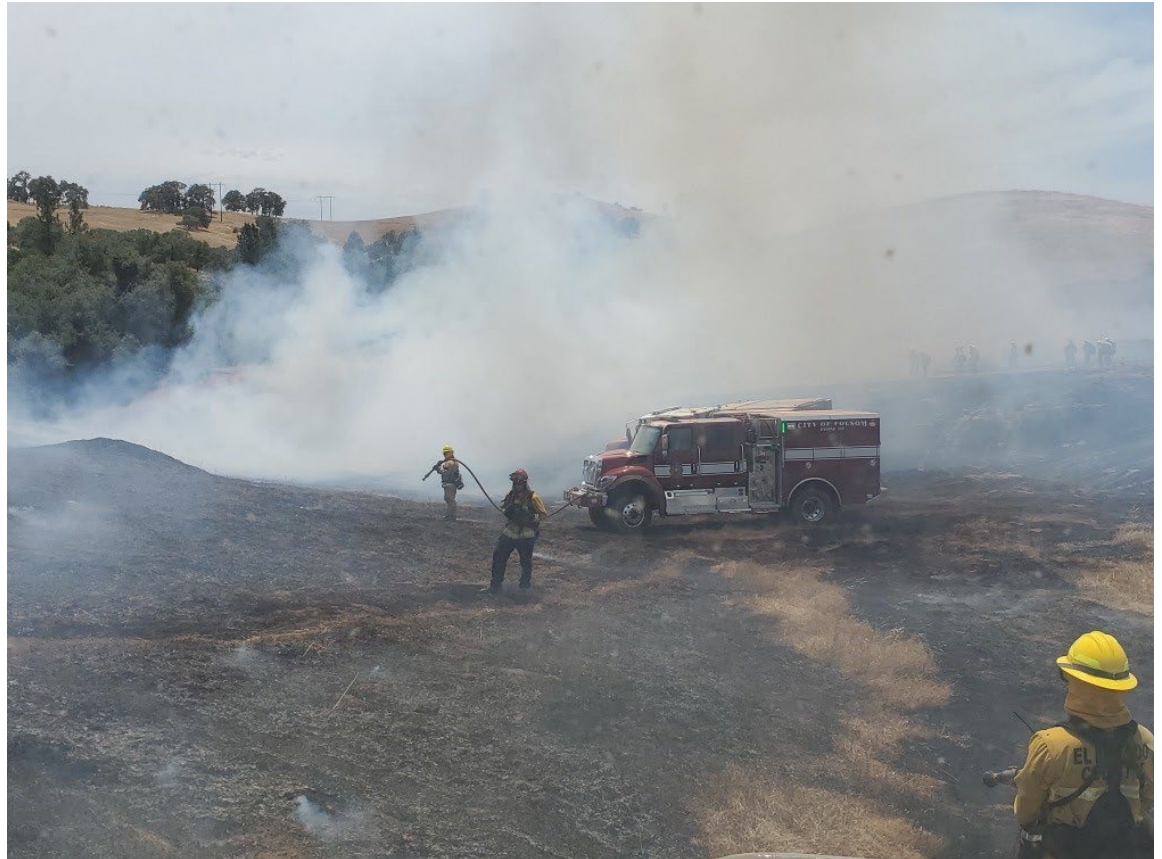
Cal Fire hosted a VMP / Live Fire Training for local firefighters.