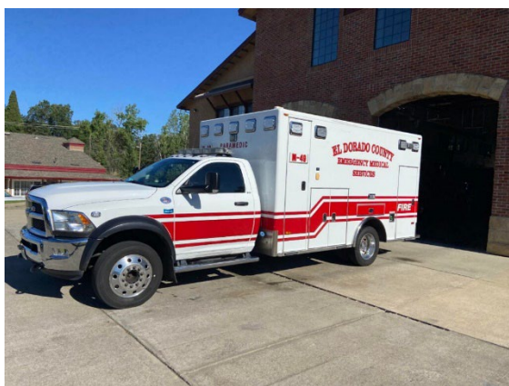
Medic 49 in Diamond Springs went offline July 1, 2022 due to staffing shortages.