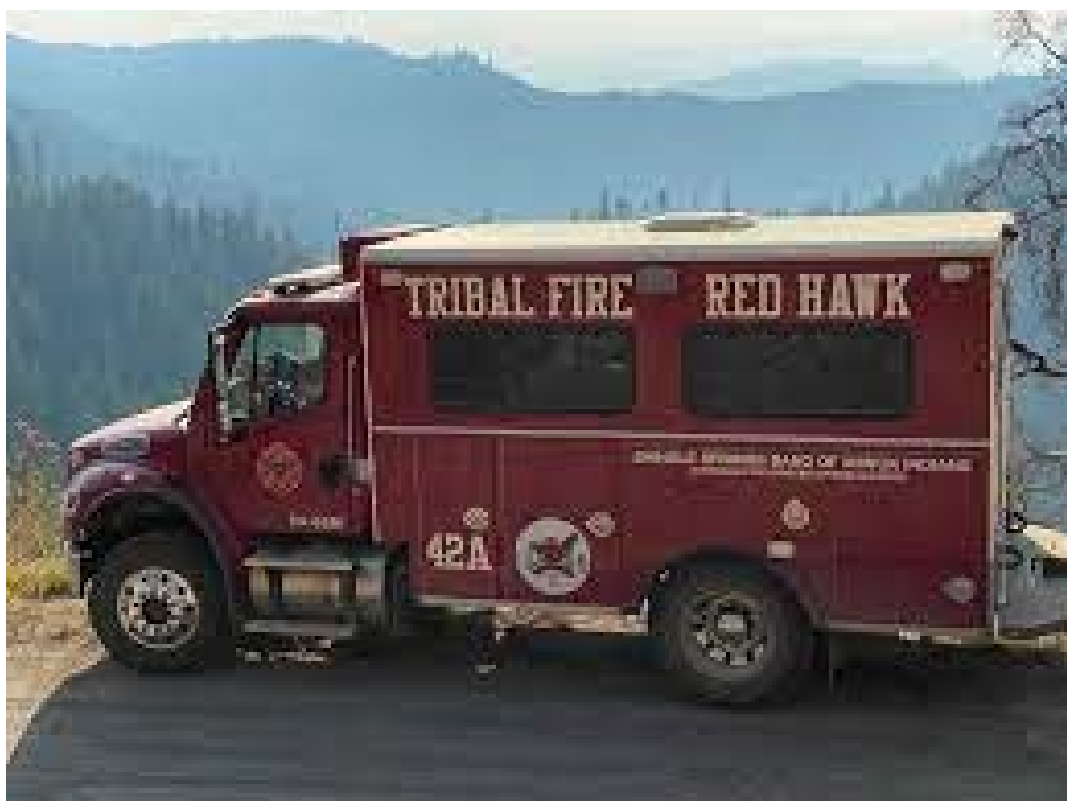
Tribal Fire Crew 42, a Type 2 Initial Attack Handcrew. Photo taken on their assignment at the McCash Fire last summer.