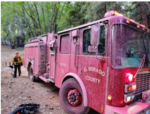
Engine 19 along with Water Tender 21 took a hit from air tanker(s) during the Cable Fire.

Your health and safety are our priorities!